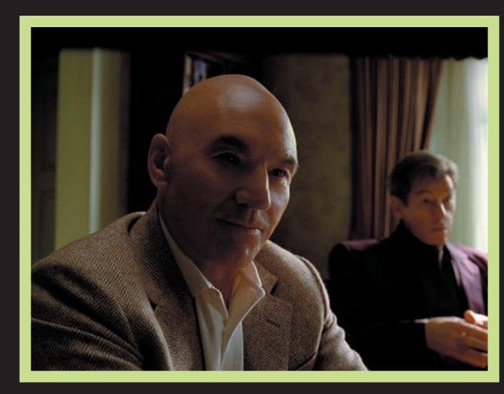
TM & © 2006 Twentieth Century Fox. X-Men Character Likenesses TM and © 2006 Marvel Characters Inc.

How long did the 20-25 shots take to complete?