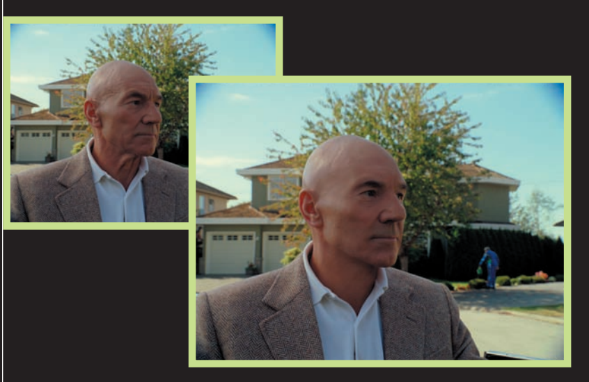
TM & © 2006 Twentieth Century Fox. X-Men Character Likenesses TM and © 2006 Marvel Characters Inc.